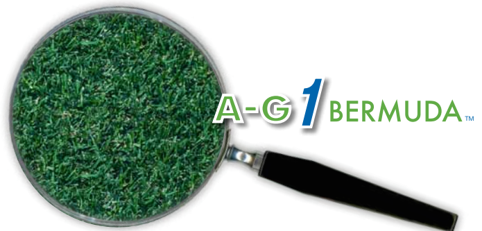
A-G 1 BERMUDA

Tifway: A versatile hybrid Bermuda which tolerates close mowing and is disease resistant. It spreads rapidly to provide a dense turf which is wear tolerant and heals quickly. This water conservative grass becomes dormant in the winter and may develop some thatch. Available overseeded with perennial ryegrass for winter installation jobs.